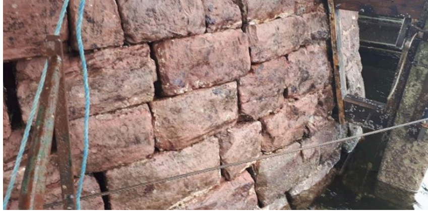
Harbour after cleaning...

In the process of undertaking this work we uncovered what appears to have been a chamber constructed from concrete and stone to house a WW2 mine. Fortunately, there were no longer any munitions in the hole but many thanks to the Police and Coast Guard who responded with alacrity to advise on the situation and our contractors who bravely excavated by hand in strong winds and encroaching darkness.